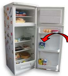
to put ... in