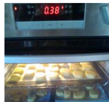
to cook = to bake