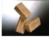
white sugar & brown sugar