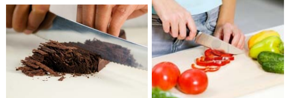
to chop ≈ to slice