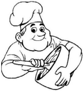
to mix = to cream = to stir = to whisk