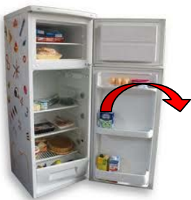
to put ... out