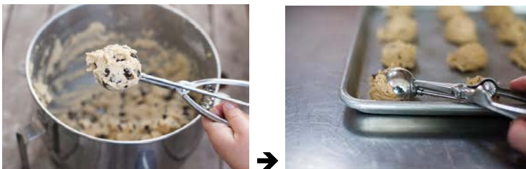
to scoop the cookie dough onto the baking sheet